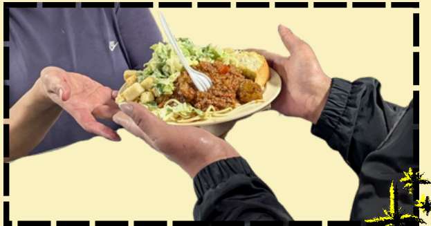
Fresh warm meals each night. Cooked by our chef!

Our programming is open nightly 7-days a week , from 11:00pm – 7:00am